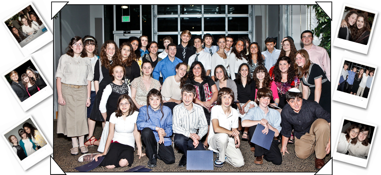
Volunteers at our Annual Dinner